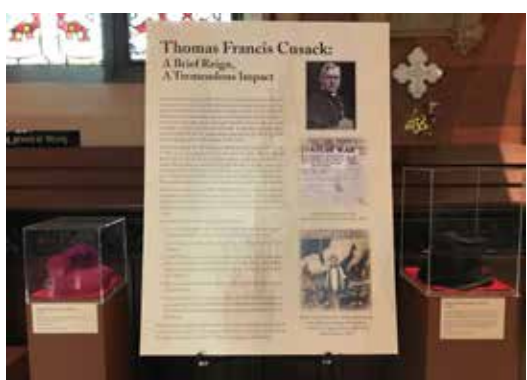
Bishop Cusack's Top Hat, c. 1915 and the displays of From the Collection.

A NUMBER OF THE OBJECTS CHOSEN FOR DISPLAY WERE "REDISCOVERED" IN THE FINAL STAGES OF THE RESTORATION OF THE SACRISTIES AND DURING RECENT WORK AT THE RECTORY.