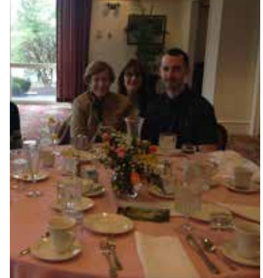
Scenes from the Annual Cathedral Brunch, April 2018