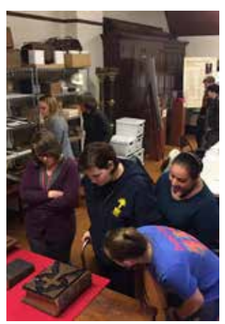
Graduate students from UAlbany's Public History Program held a class in the Cathedral's History Room.