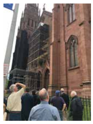
Local architects view ongoing restoration efforts at the Cathedral, including current work on the Rose Window.