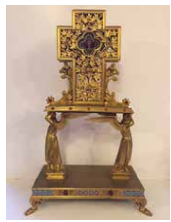
Relic of the True Cross