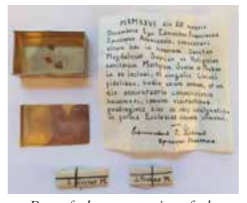
Part of the conservation of the Cathedral's relics included opening unidentified sealed boxes that contained relics, so they could be properly cared for and cataloged.