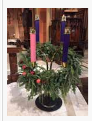
Parishioners and visitors are noticing our new Advent Wreath on the altar.

The purpose of the Cathedral parish newsletter is to help carry out the mission of our beloved house of prayer and worship through a quarterly publication that includes personal glimpses of the faith journeys of those individuals who comprise the parish family. Unlike the scope of the weekly bulletin, which sometimes includes information about events that relate to programs outside the Cathedral, this newsletter focuses on events within the Cathedral parish.