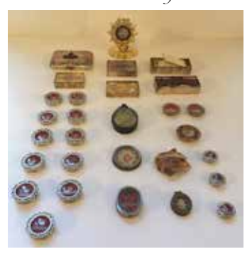
The Cathedral's collection of relics.